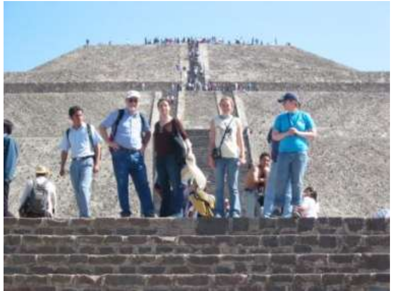
Participants of a previous trip at the pyramids of Teotihuacan.