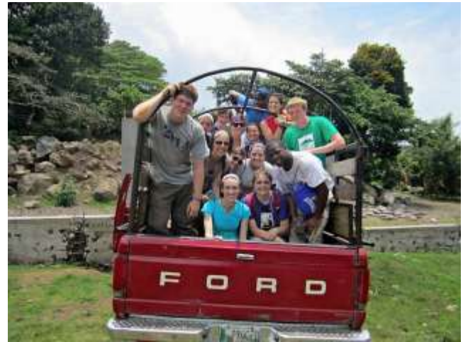
Members of the Guatemala Trip leaving work .